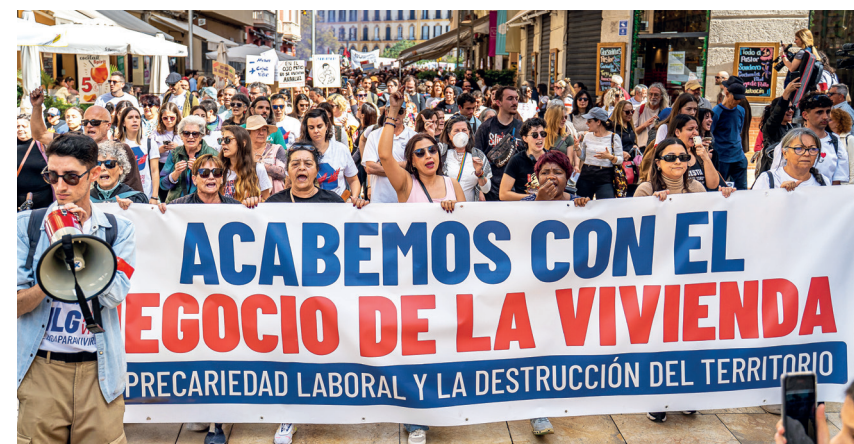
PROPERTY PROTESTS: Should be demonstrating about building quality

Being a plumber is both my enemy and my friend, but the simple fact is local builders need to up their game